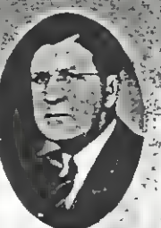
G. H. Schalts Lumber Retail